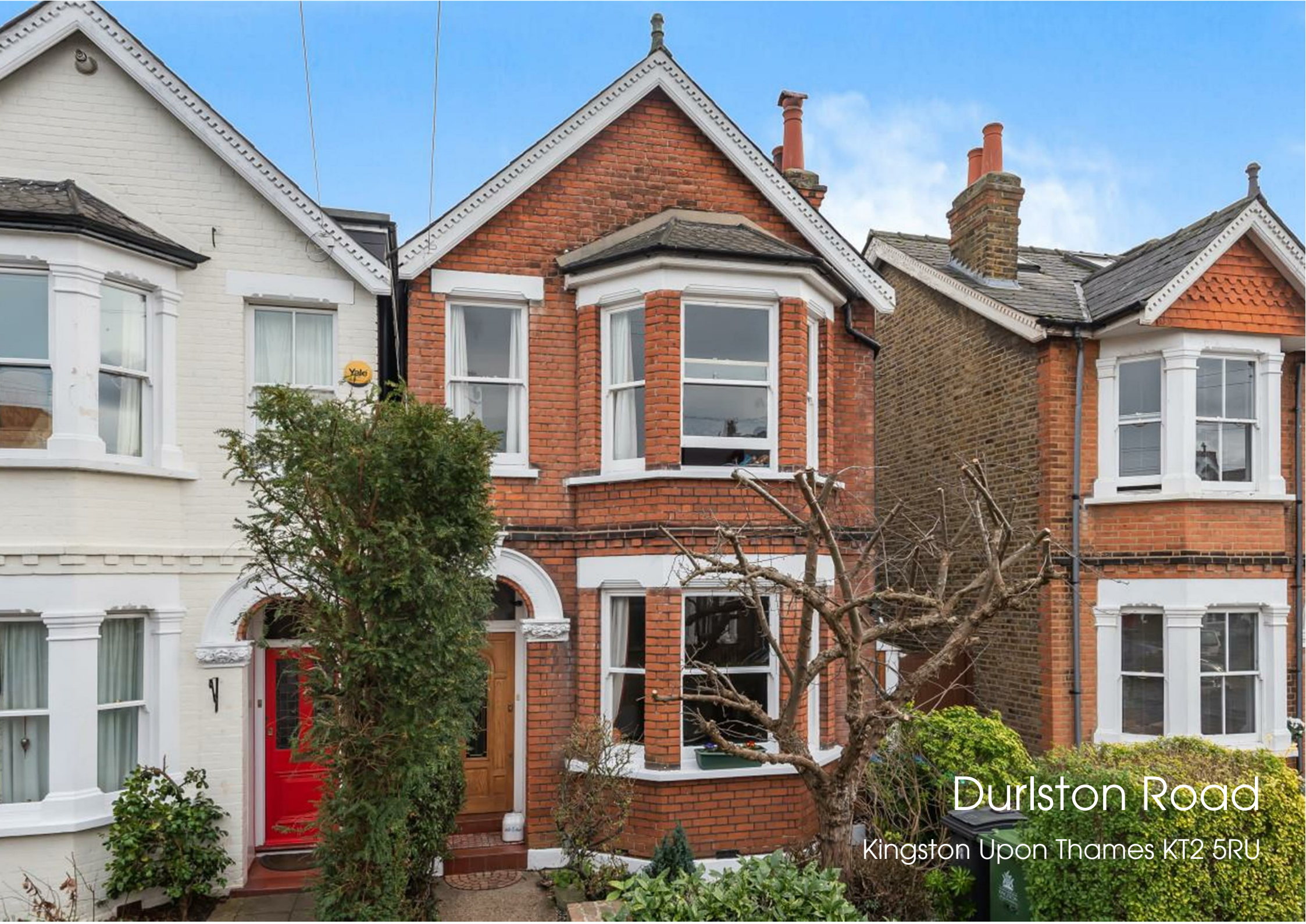
Durlston Road Kingston Upon Thames KT2 5RU